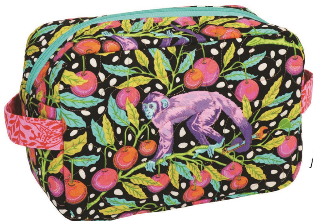
Pictured: Monkey Wrench by Tula Pink for FreeSpirit Fabrics