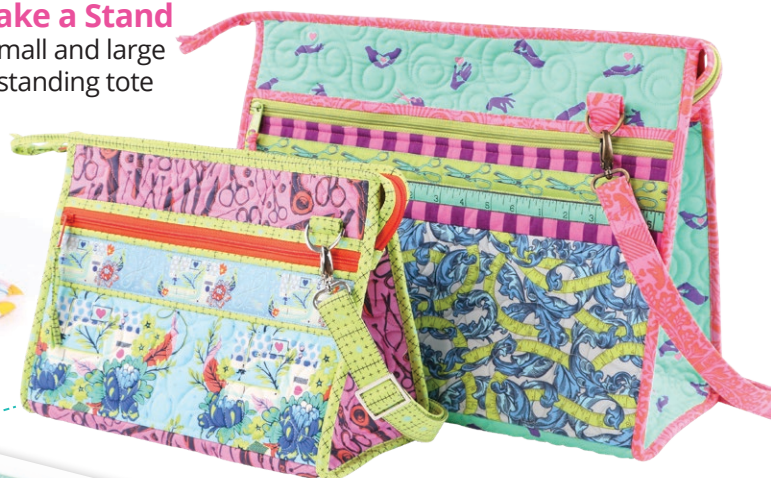
Take a Stand small and large standing tote