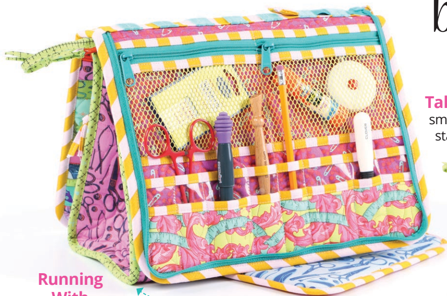
Running With Scissors tool case