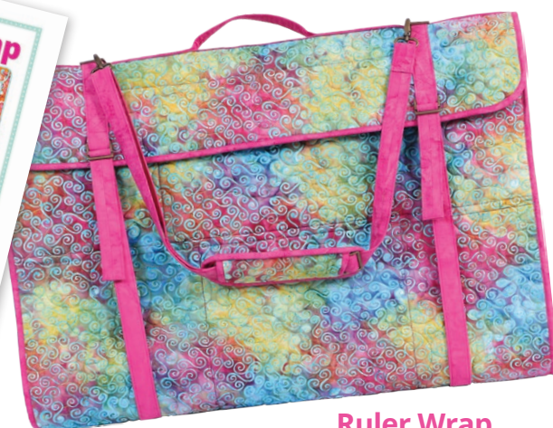
Ruler Wrap carrier/organizer

Store and carry rulers, an 18" x 24" mat, and more in these handy padded wraps. May be hung or folded for travel.