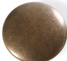
Antique Brass CAP