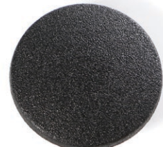
Low Profile Plastic CAP