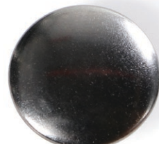
Black Metal CAP